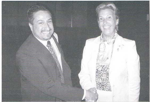
Congratulating the new President-elected of the FDI