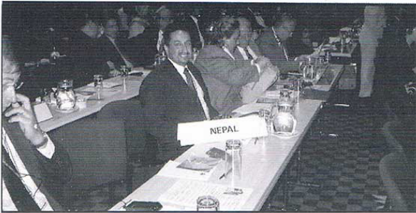
Representing in World Congress