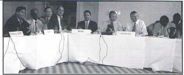
Representing NDA at the APDF meeting after Nepal being accepted as a regular member.