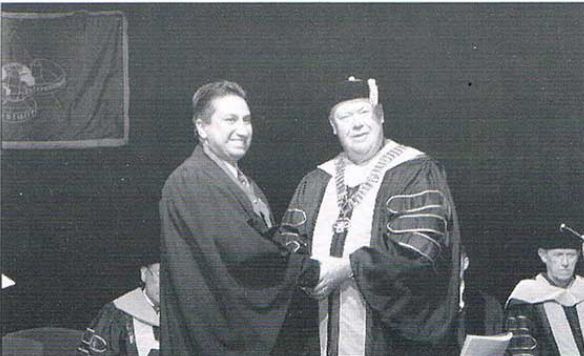
Receiving A Fellowship of Academy of Dentistry International in Sydney, Australia.