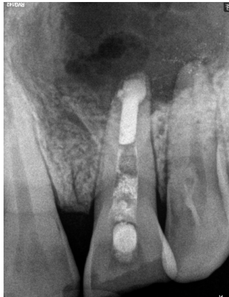
Figure 6: IOPAR showing retrograde filling