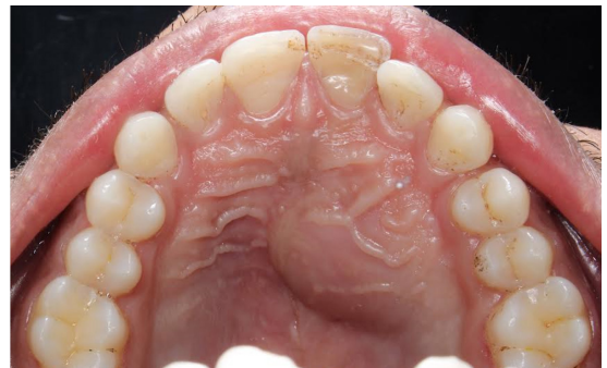
Figure 2: Palatal view