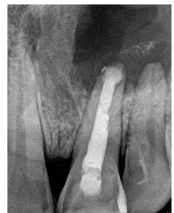
Figure 11: IOPAR showing three month followup