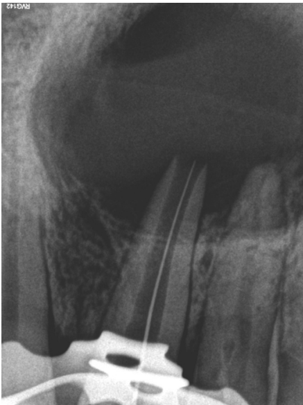
Figure 5: IOPAR of Working length determination