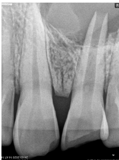
Figure 3 : Preoperative IOPA radiograph