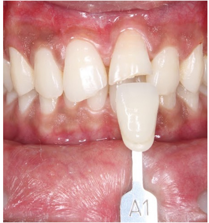
Figure 8 & 9 : Showing two session of application of bleaching agent where the tooth discoloration shade changed from A3.5 to A1(Vitapan classical)

After gaining the desired shade, the pulp chamber was thoroughly rinsed to remove all remnants of bleaching material and definitive restoration was done with composite after two weeks.