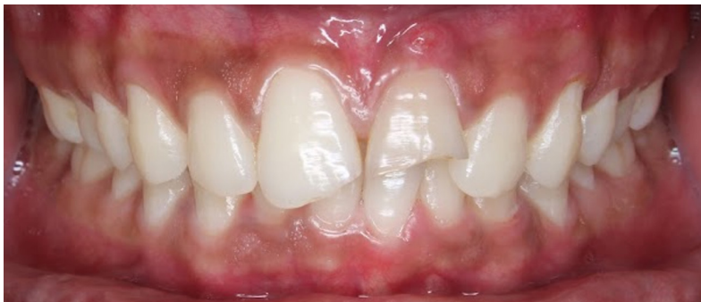
Figure 1 : Preoperative photograph

Based on clinical and radiographic findings, the diagnosis was a necrotic pulp with chronic apical abscess with open apex. The treatment plan included root canal treatment of tooth 21, surgical enucleation of the cyst, apicoectomy with retrograde filling, thermoplasticized obturation, and subsequent esthetic rehabilitation with intracoronal bleaching.