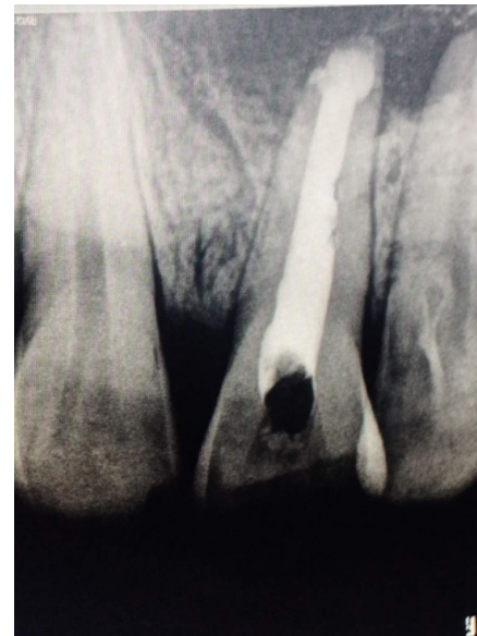
Figure 7 : IOPAR showing obturation with thermoplasticized guttapercha