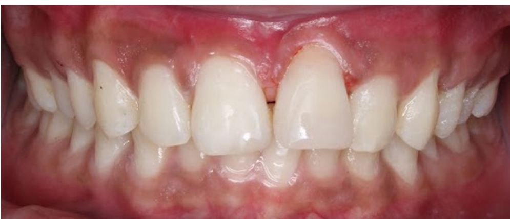
Figure 10. Final composite restoration

The access cavity and fractured portion were etched, bonded, and restored with a nano-hybrid composite resin. Final finishing and polishing were performed to achieve optimal esthetics.