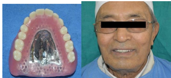
Figure 9: Finished denture