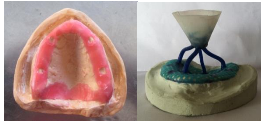
Figure 3: Master cast with relief wax