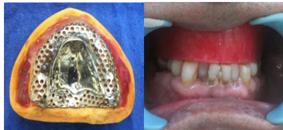
Figure 5: Cobalt chromium alloy denture base