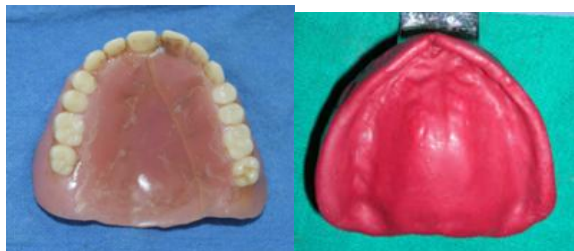
Figure 1: Maxillary denture with multiple fracture lines

The major disadvantages associated with metal denture bases include increased cost, difficulty in fabrication, compromised esthetic qualities, and inability to rebase such prostheses. 10 Nevertheless, they may be indicated when polymer-based systems fail to provide acceptable physical properties. The fabrication of metal denture bases is not complicated and not cost prohibitive when base metal alloys are used.